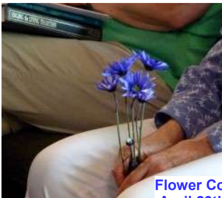
Flower Communion April 29th

Attention, please! It's National Humor Month and everyone from the ISHS (International Society for Humor Studies) to HAHA (Humor Alliance for Healthy Attitudes) are talking. The Scholarly members of the ISHS will gather in Krakow in June to explore, in depth, the current research into Polish humor. HAHA is having a laugh-in somewhere in Florida.